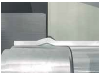
The tool shape defines the outer contour of the formed tube wall