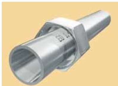
Tube end is prepared and equipped with EO nut