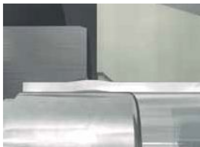
While moving, the pin is continuously forming the tube wall and compressing the material