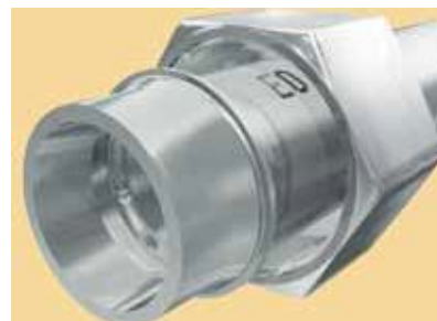
Installation is made in the fitting body

section, the seal effectively compensates for all manufacturing tolerances between the tube and fitting cone.