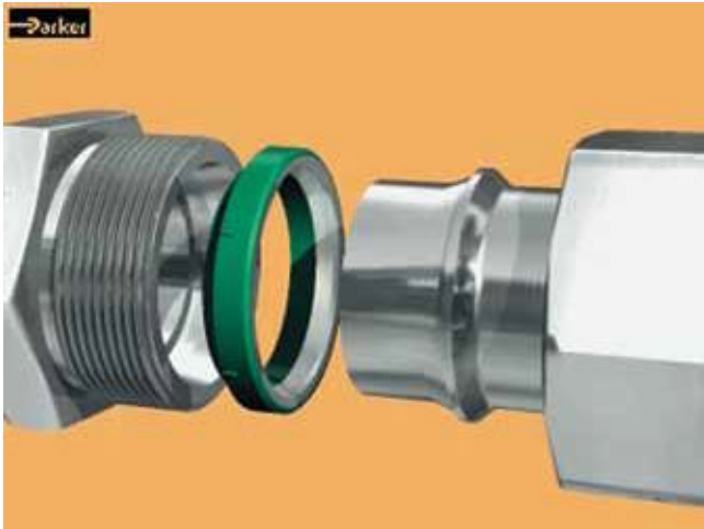
Before tightening the nut