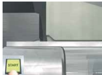
After starting the process, the dies clamp the tube and the forming pin starts to move forward