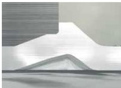
As soon as the moving pin touches the clamping jaws, the forming process is completed