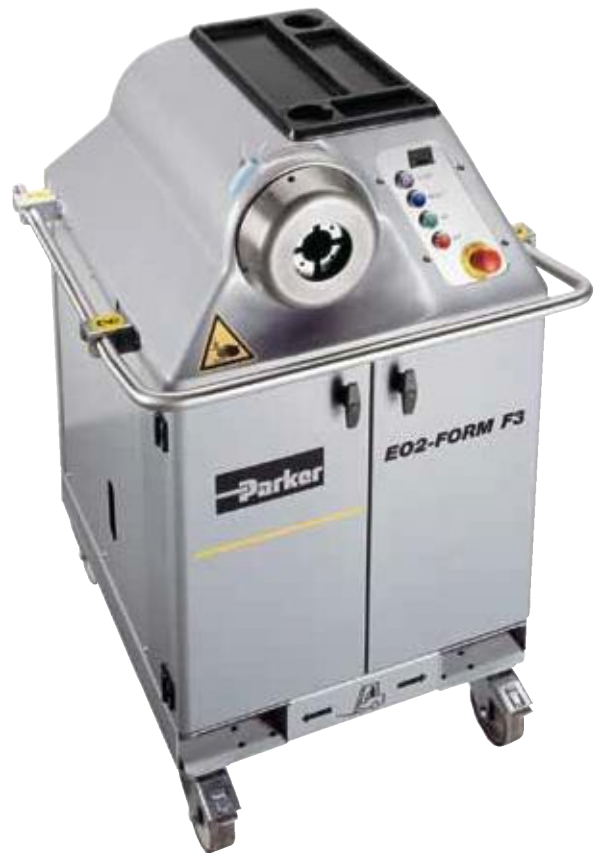
The EO2-FORM F3 machine

and fitting bodies come from the EO-2 program. The only investment needed is the forming machine, which pays off quickly as it reduces assembly time and effort. Assembly characteristics of EO2-FORM are similar to EO-2 too. This allows the customer to use both products for his hydraulic pipework without increasing stock or confusing workfloor engineers with new components.