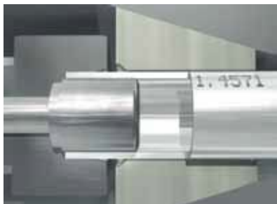
Tube is inserted into the tools until it firmly touches the stop at the end