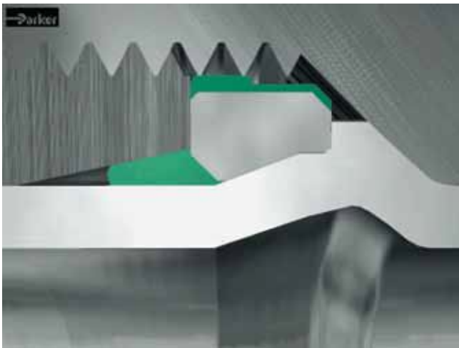
After tightening the nut