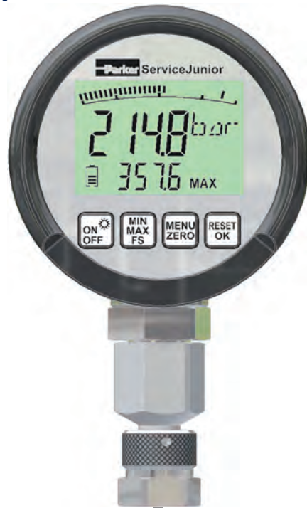
ServiceJunior with adapter 1/4" BSPF female - M16x2 female SCA-1/4-EMA-3